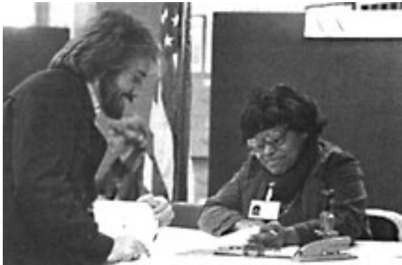
The VA in 1968 initiated Operation Outreach to make veterans more aware of their benefits.

To assist all Vietnam-era veterans, the VA adopted new outreach measures to bring benefits to their attention. Veterans assistance centers were established in 21 cities to help recently separated servicemembers. VA representatives in 1967 were assigned to duty at Long Binh, Vietnam, to assist servicemembers before they were discharged. The VA in 1967 also installed toll-free telephone service to regional offices in each state.