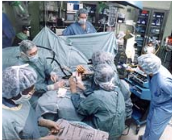
More than 5.3 million people received care in VA health care facilities in 2005.

VA operates more than 1,300 sites of care including nearly 900 ambulatory care and community-based outpatient clinics, 136 nursing homes, 43 residential rehabilitation treatment programs, nearly 90 comprehensive home-care programs, and more than 200 Veterans Centers where approximately 2 million veterans have been served since the first center opened in 1979. In 2005 alone, Veterans Centers handled more than 1 million visits by nearly 133,000 veterans and members of their families.