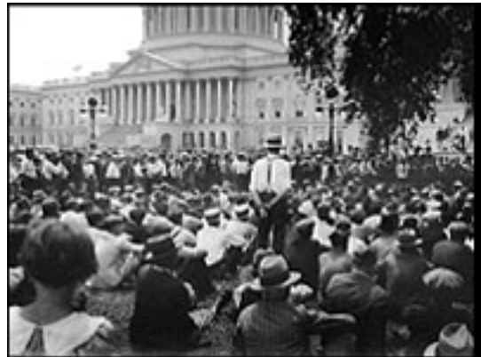
Bonus Marchers at the U.S. Capitol

President Hoover knew he had to curb the escalating violence. He gave the order for Army Chief of Staff Gen. Douglas MacArthur to forcibly remove from the city the approximately 3,500 veterans, many with their wives and children, who refused to leave. No shots were fired, but many were injured by bricks, clubs and bayonets. Although there are conflicting reports on which side started the fires, some of the marchers' shacks burned down. In the end, the presence of federal troops effectively ended the bonus march.