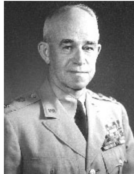
Gen. Omar N. Bradley