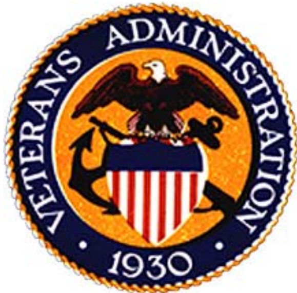
Official Seal of the former Veterans Administration