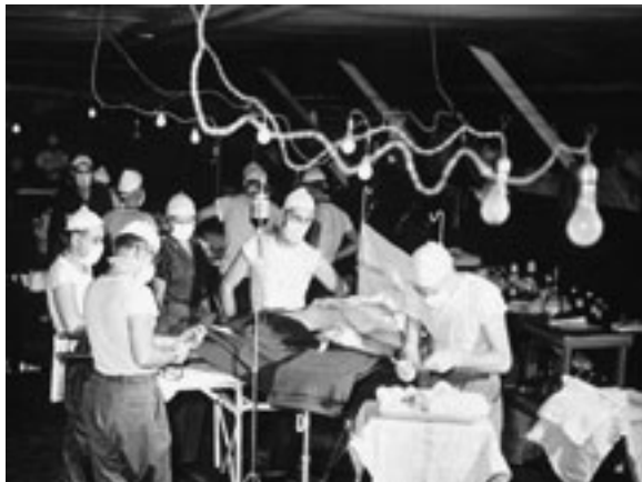
8209th Mobile Army Surgical Hospital (M.A.S.H.) Korea, August 1952

In contrast to the 48 months of education allowed by the 1944 law, the Korean GI Bill permitted a maximum of 36 months. The Korean GI Bill also did not provide tuition payments to the colleges. Instead, veterans were paid subsistence checks, which were also to cover their college expenses. The effect of the changes was that the benefit no longer completely covered the cost of the veteran's education.