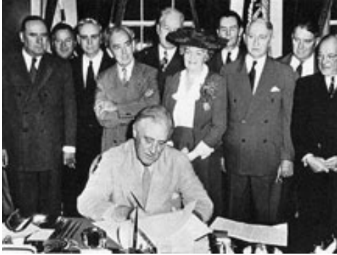
President Franklin D. Roosevelt signs the "GI Bill of Rights" into law, June 22, 1944.

The second benefit provided veterans with federally guaranteed home, farm and business loans with no down payment. This feature was designed to generate jobs in the housing industry while providing housing and assistance for veterans and their families. Veterans could apply for loans up to $2,000, with 50 percent guaranteed by the government.