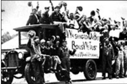
World War I Veterans Descend on Washington, DC

The Great Depression was merciless. The loss of jobs, life savings and confidence left many unable to make a living. Trapped in its wake, World War I veterans suffered tremendous pressure during the economic slump. After returning from the Great War, many faced destitution and did all they could to survive.