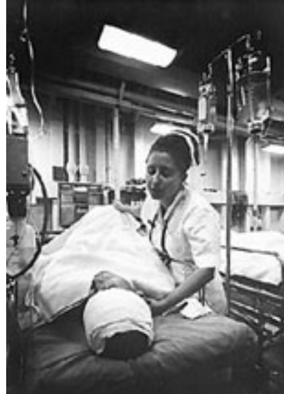
A nurse tends a patient just out of surgery in the intensive care ward of the hospital ship USS Repose (AH-16) off the coast of Vietnam.

Advances in airlift and medical treatment meant that many wounded and injured personnel survived who would have died in earlier wars. By 1972 there were 308,000 veterans with disabilities connected to military service.