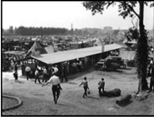
Bonus Marchers' Encampment

the veterans' attempts to drum up support for the bill, it was overwhelmingly defeated. Frustrations mounted as the summer wore on.