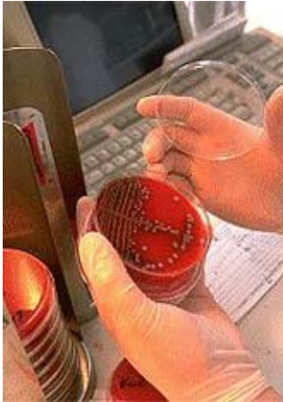
In 2005, VA supported approximately 3,800 researchers at 115 VA medical centers.

pressure. The “Seattle Foot” developed in VA allows people with amputations to run and jump.