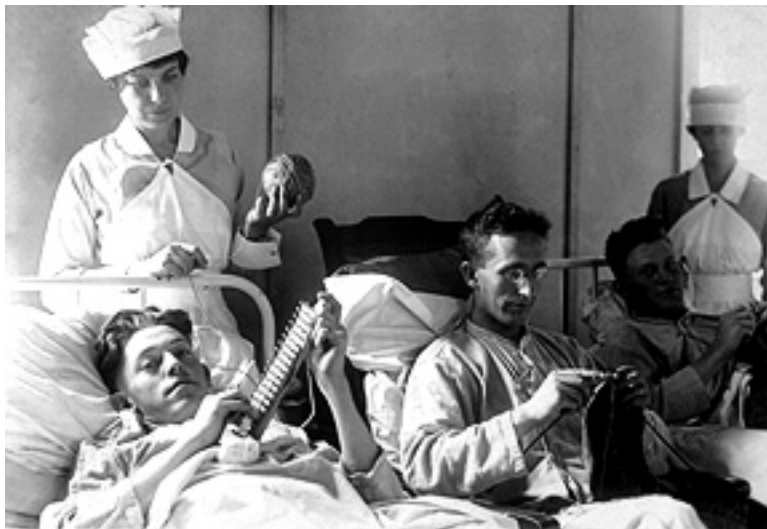
Injured World War I soldiers recovering at Walter Reed Army Medical Center, Washington, DC

The War Risk law was amended in mid-1917 to provide insurance against loss of life, personal injury or capture by the enemy of personnel on board American merchant ships. The amended law also offered government-subsidized life insurance for veterans. Other legislation provided for a discharge allowance of $60 at the end of the war.