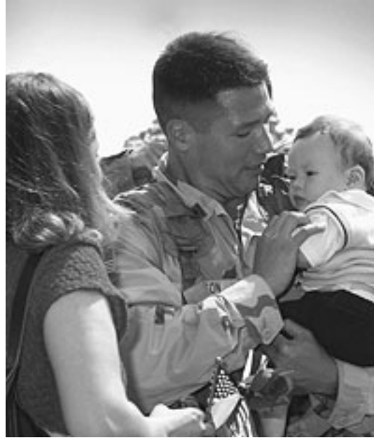
Combat veterans are eligible for VA health care for two years after leaving the service.

Since 1998, veterans who served in a combat zone or in comparable hostilities have been eligible for free VA hospital care, outpatient services and nursing home care for two years after leaving active duty for illnesses and injuries that may be the result of their military service. In 2000, VA established the Benefits Delivery at Discharge program at military discharge sites to assist service members separating from the military.