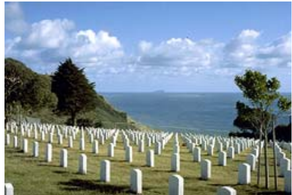
Fort Rosecrans National Cemetery, San Diego, Calif.

In 2005, VA national cemeteries conducted more than 93,000 interments, provided nearly 364,000 headstones or markers for veterans' graves and approximately 488,000 Presidential Memorial Certificates to veteran's next of kin and loved ones to commemorate honorably discharged, deceased veterans. Since 1973, the department has provided more than 9.2 million headstones and markers. Additionally, VA has awarded more than $258 million for the development, expansion or improvement of 63 state veterans cemeteries. In 2005, nearly 21,000 veterans and family members were buried in those cemeteries.