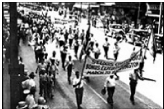
World War I Bonus Marchers

As the Depression worsened, veterans began calling for immediate payment of their "bonuses," as the certificates came to be called. In March 1932, a small group of veterans from Oregon began marching to Washington, D.C., to demand payment. Word of the march spread like wildfire and soon small bands of unemployed veterans from across the country began descending on the nation's capital.