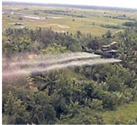
The herbicide Agent Orange was used extensively to defoliate trees and remove cover for the enemy.

The VA in 1981 established a special eligibility program which provides free follow-on hospital care to Vietnam veterans with any health problems whose cause is unclear.