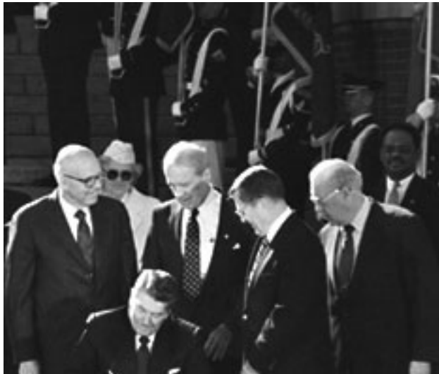
President Reagan signing legislation elevating VA to Cabinet status

Proponents seeking Cabinet-level status for the Veterans Administration had long stressed that the VA was the largest independent federal agency in terms of budget and was second only to the Defense Department in the number of employees. Because one-third of the U.S. population was eligible for veterans benefits, proponents argued, the agency responsible should be represented by a cabinet secretary having direct access to the president.