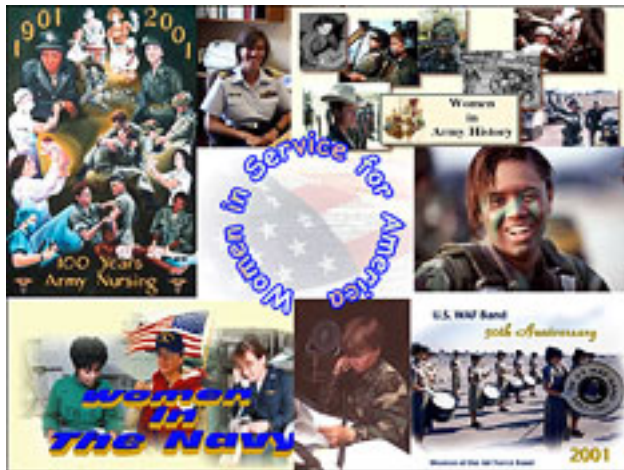
VA's Center for Women Veterans

In response to the growth in the number of women veterans, VA has expanded medical facilities and services for women and increased efforts to inform them that they are equally entitled to veterans benefits. The Veterans Health Care Act of 1992 provided authority for a variety of gender-specific services and programs to care for women veterans.