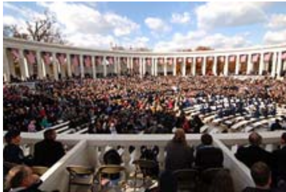
Veterans Day ceremony at Arlington National Cemetery

Of the 24.3 million veterans alive at the start of 2006, nearly three-quarters served during a war or an official period of conflict. About a quarter of the nation's population, approximately 63 million people, are potentially eligible for VA benefits and services because they are veterans, family members or survivors of veterans. VA's fiscal year 2005 spending was $71.2 billion, including $31.5 billion for health care, $37.1 billion for benefits, and $148 million for the national cemetery system.