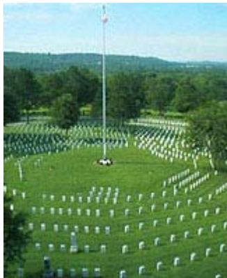
Fayetteville National Cemetery

Proponents of the measure argued that the program would attract more enlistees and improve retention rates. However, initial participation in VEAP was low. And the program was not inducing sufficient numbers to join nor to stay through the initial enlistment. The educational level of recruits also declined.