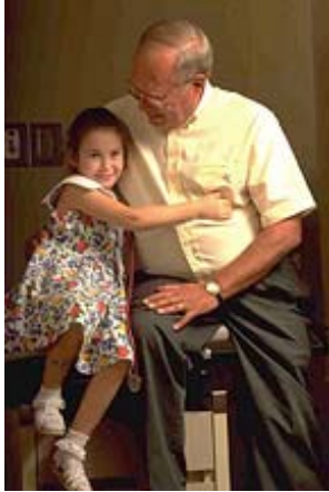
VA programs provide $1.1 trillion insurance coverage.

VA directly administers six life insurance programs and supervises the Servicemembers' Group Life Insurance and the Veterans' Group Life Insurance programs. These programs provide $1.1 trillion in insurance coverage to 4.5 million veterans, active-duty servicemembers, reservists and Guardsmen, plus 3 million spouses and children.