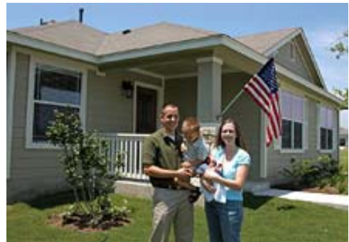
In fiscal year 2005, VA guaranteed 165,854 loans valued at $25 billion.

From 1944 — when VA began helping veterans purchase homes under the original GI Bill — through May 2006, VA issued more than 18 million VA home loan guarantees, with a total value of $892 billion. In fiscal year 2005 alone, VA guaranteed 165,854 loans valued at $25 billion and, at the beginning of fiscal year 2006, had 2.3 million active home loans reflecting amortized loans totaling $202.1 billion. VA’s specially adapted housing programs helped about 587 disabled veterans with grants totaling more than $26 million in 2005.