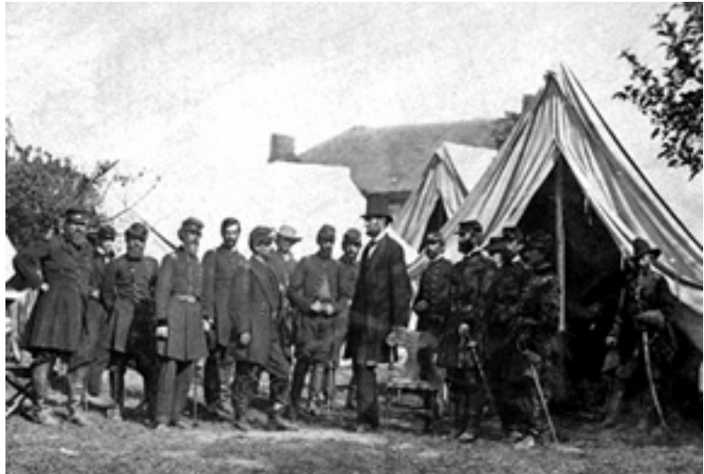
President Lincoln at the Antietam battlefield, October 1862

When the Civil War broke out in 1861, the nation had about 80,000 war veterans. By the end of the war in 1865, another 1.9 million veterans had been added to the rolls. This included only veterans of Union forces. Confederate soldiers received no federal veterans benefits until 1958, when Congress pardoned Confederate servicemembers and extended benefits to the single remaining survivor.