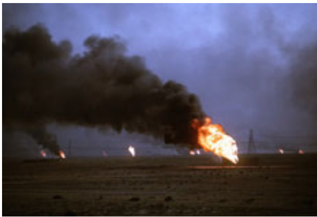
Kuwaiti oil wells set afire by retreating Iraqi troops following Operation Desert Storm.

Gulf War veterans, even before the hostilities ended, began complaining of symptoms with no readily identifiable cause. The symptoms included fatigue, skin rash, headache, muscle and joint pain, memory loss and difficulty concentrating, shortness of breath, sleep problems, gastrointestinal problems and chest pain.