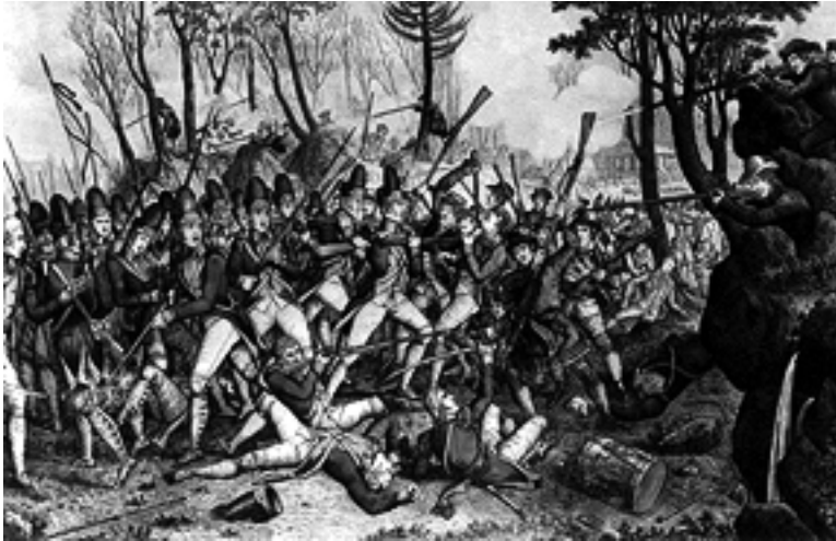
Battle of Lexington, April 19, 1779

From the beginning, the English colonies in North America provided pensions for disabled veterans. The first law in the colonies on pensions, enacted in 1636 by Plymouth, provided money to those disabled in the colony's defense against Indians. Other colonies followed Plymouth's example.