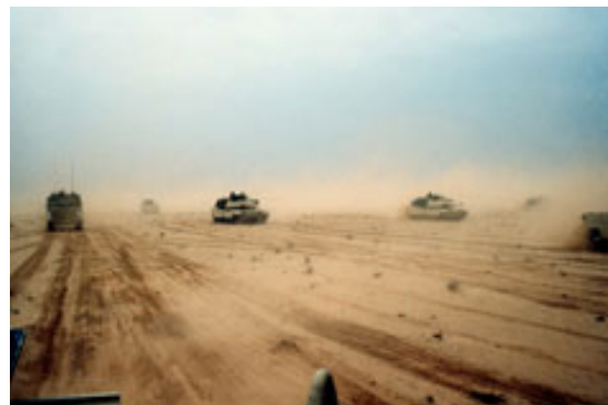
M-1A1 Abrams main battle tanks in northern Kuwait during Operation Desert Storm.

The legislation extended to Persian Gulf War veterans eligibility for wartime-only pensions, medical treatment, educational benefits, housing loans and unemployment payments.