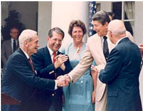
Congressman Sonny Montgomery, left, is congratulated by President Ronald Reagan.

Late in the 1980s, VA dedicated resources to serving homeless and chronically mentally ill veterans. It also responded to the growing numbers of patients with Acquired Immune Deficiency Syndrome (AIDS) with special treatment units and special training for medical staffs.